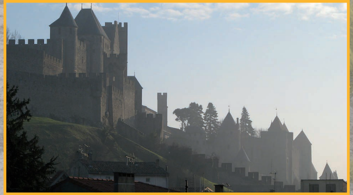
The fortified city of Carcassonne...