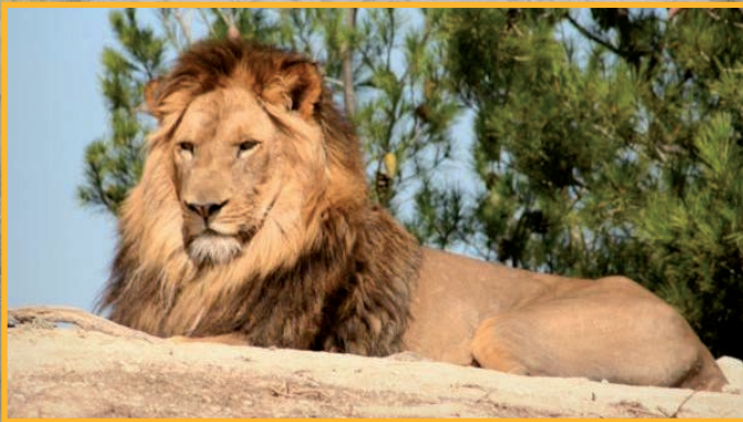
The Sigean african reserve...