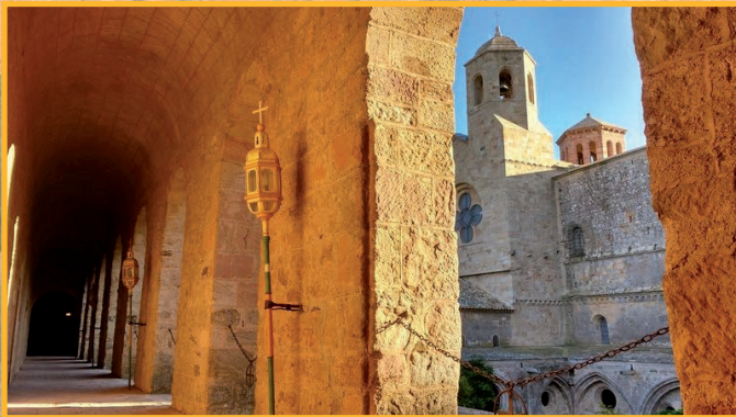
Abbay of Fontfroide...