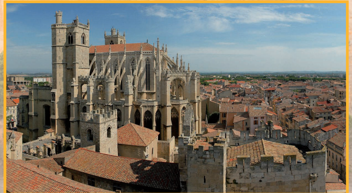
The roman city of Narbonne...